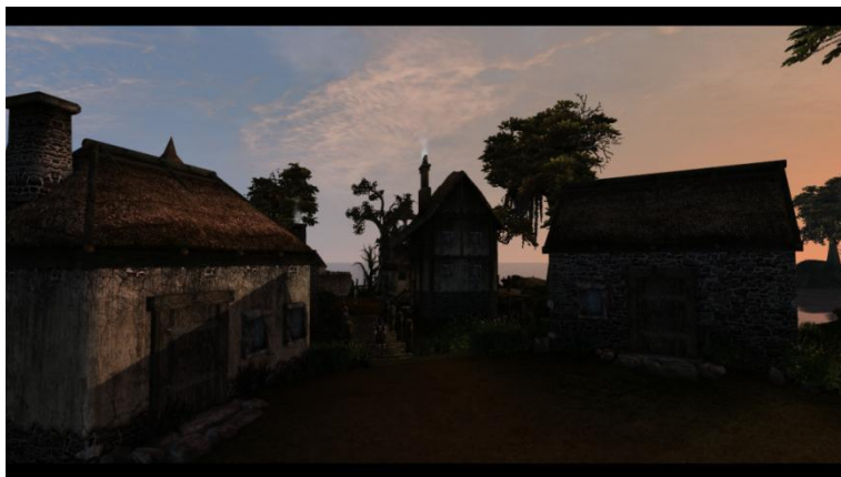
Isn't Seyda Neen just BEAUTIFUL?!