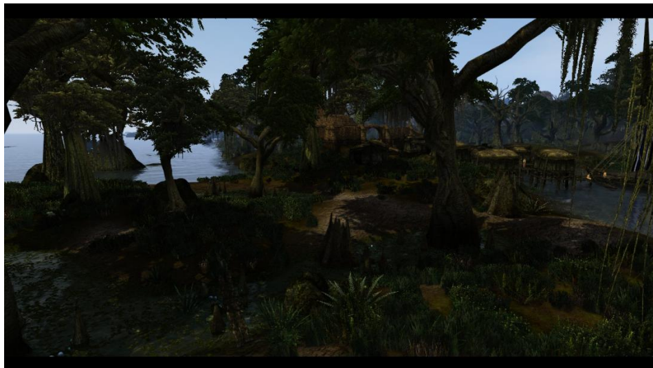
Screen of victory!