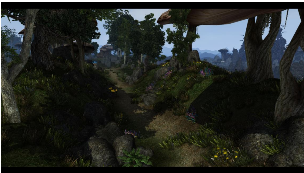
Ascadian Isles Region in all its beauty.

No, I don't want to hack your PC or damage you in any way: some tools that are included in Morrowind Overhaul could have loads of problems with UAC. Trust me, do this!